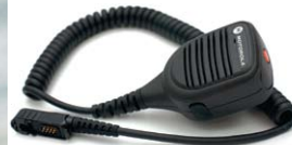
Enhanced large remote speaker microphone with noise-canceling microphone, loud audio, audio jack and emergency button, IP54.