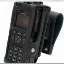
Hard leather case with 3" swivel belt loop, fits simple and full keypad models.

Enhanced receiver sensitivity and DMO repeater functionality means excellent coverage in buildings and over extended areas.