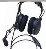
Dual-muff over the head headset with boom microphone and in-line push-to-talk, 24 dB NRR.