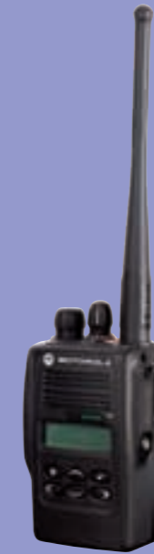
GP366R & GP666R